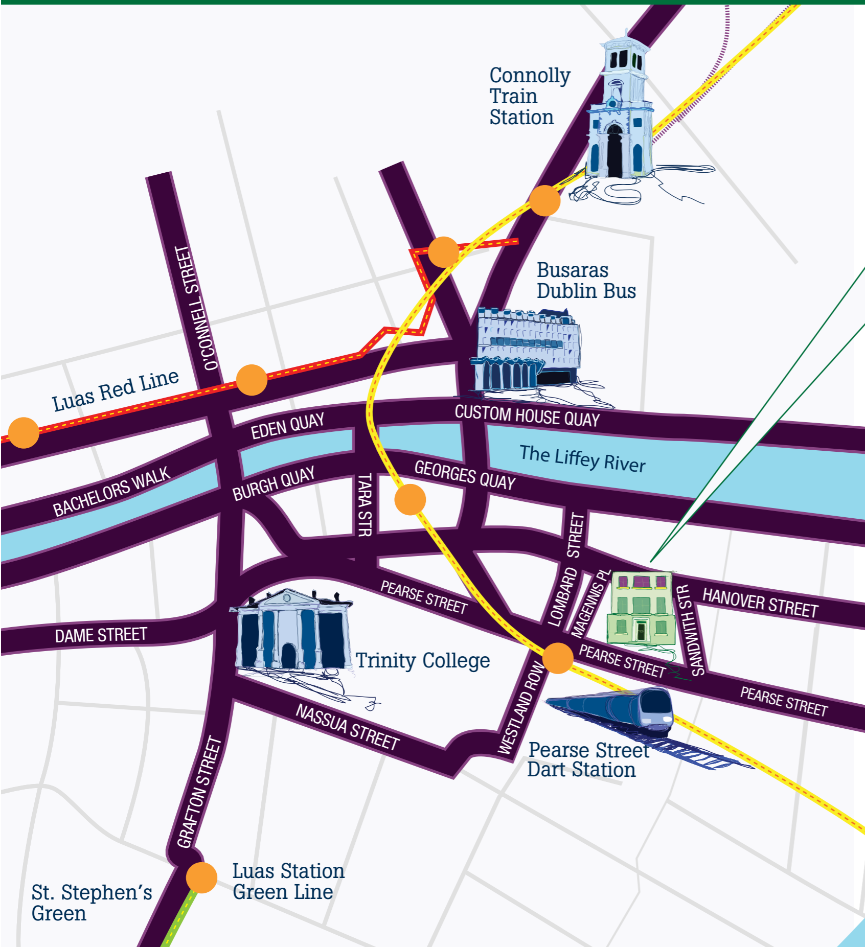
Magnified Map of Westland Square, Pearse Street